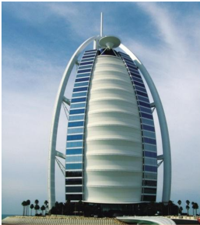
Burj Al Arab Hotel

Work in pairs. Talk about the following pictures and tell what you know about them.